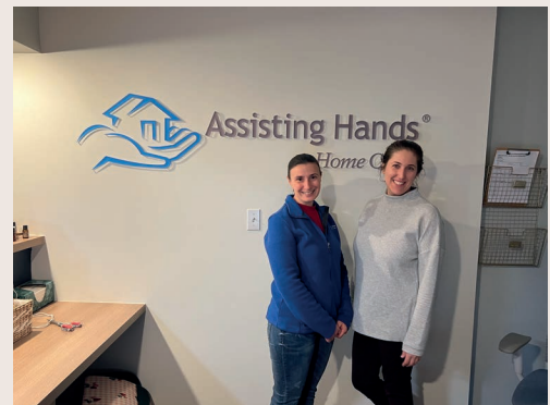
Assisting Hands Home Care, Arlington Heights