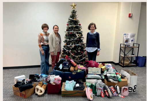
FamilyForward staff with gifts from First Pres PDO & Preschool of First Presbyterian Church of Arlington Heights