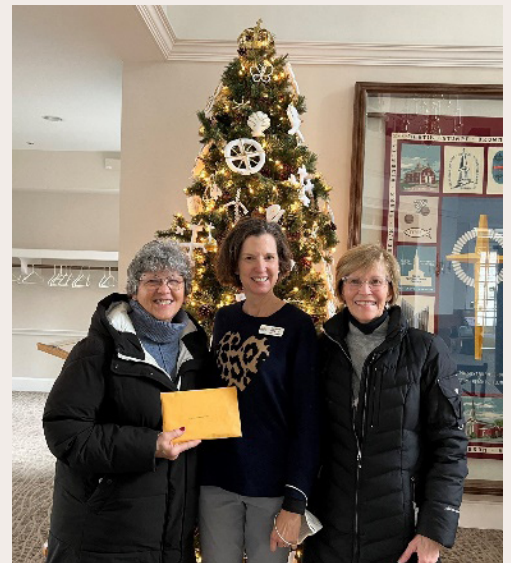
United Women in Faith, First United Methodist Church of Arlington Heights