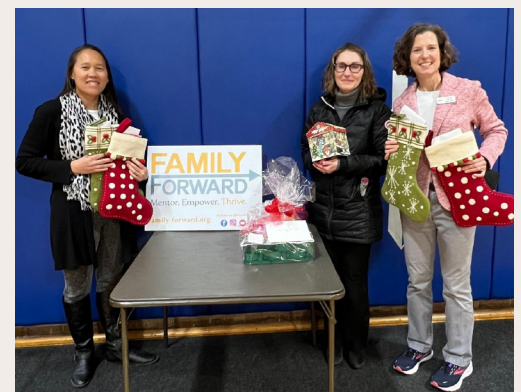
Women of St. James, St. James Parish, Arlington Heights