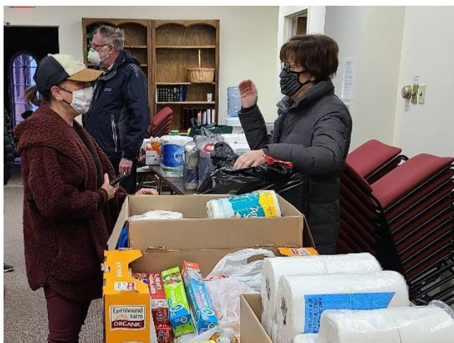
We are grateful to The FOCUS Group.

Faith Community Homes is a member of the Schaumburg Business Association and an SBA networking group called The FOCUS Group, comprising 20 business leaders. In September, The FOCUS Group held a fundraising event for FCH at Top Golf in Schaumburg. In November, the group held a drive to collect household supplies for our program families. This group was phenomenal in raising an additional $1,000 and brought in a large load of household supplies such as toilet paper, paper towels, detergent and many other cleaning supplies families need. We encourage donations of these materials because while many families do have an Illinois Link card, which can be used to pay for groceries, the card does not cover these much needed, but quite costly household and cleaning supplies. We are very grateful to these business leaders, who are dedicated to making the community a better place for all.